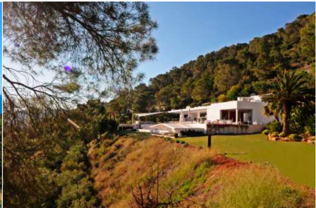
GARDEN AREA AND CHILL OUT ZONE