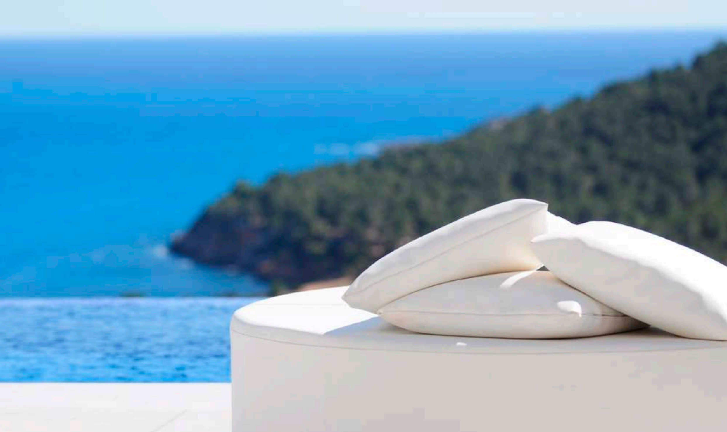
POOL TERRACE AND POOL WITH VIEWS TOWARDS SA CALETA