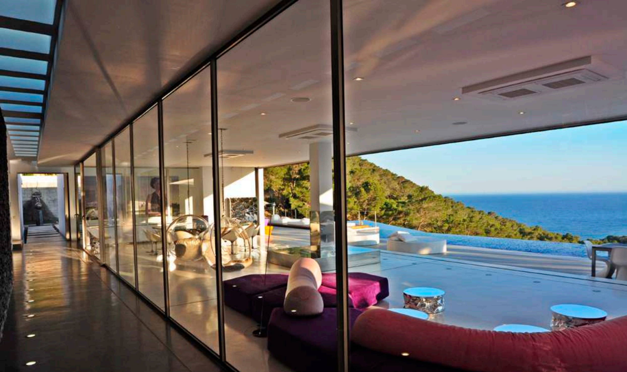
MAIN ENTRANCE THAT OVERLOOKS THE LIVING ROOM AND POOL AREA