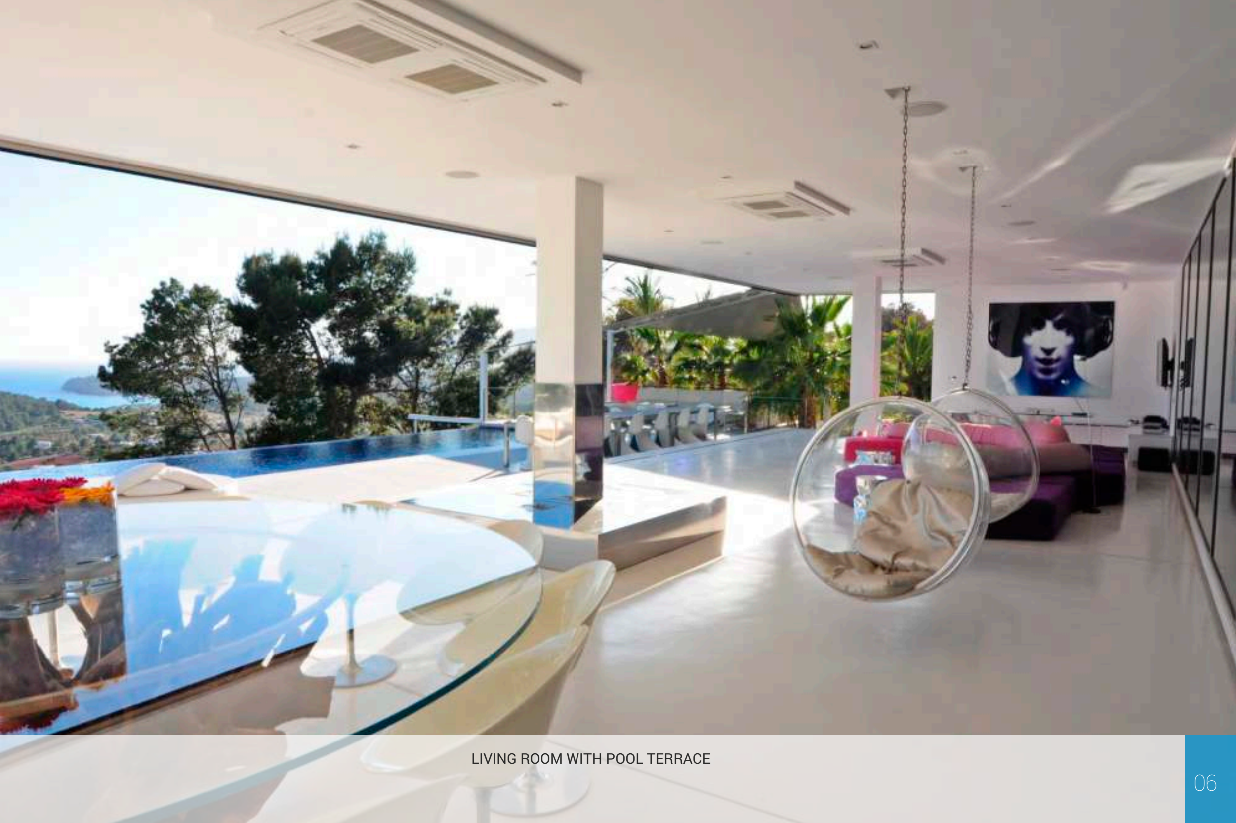
LIVING ROOM WITH POOL TERRACE