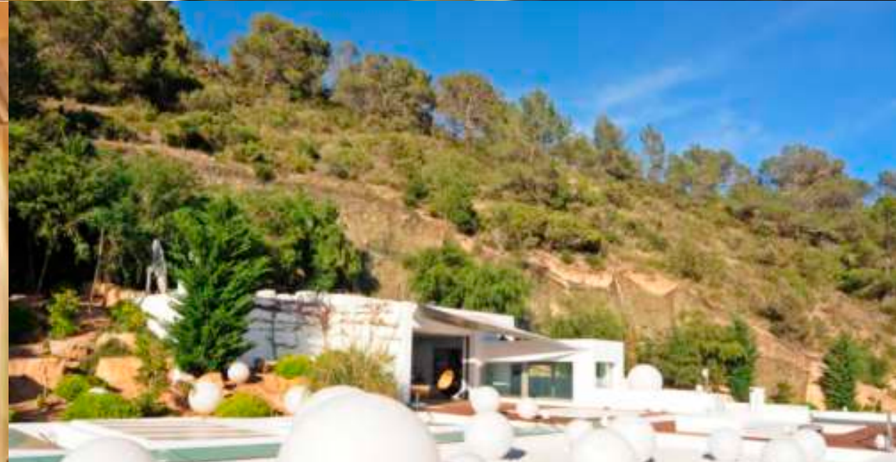
THE PRIVATE TERRACE