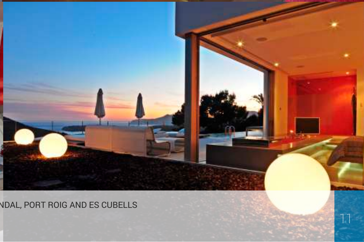
THE RED ROOM WITH VIEWS OF CALA YONDAL, PORT ROIG AND ES CUBELLS