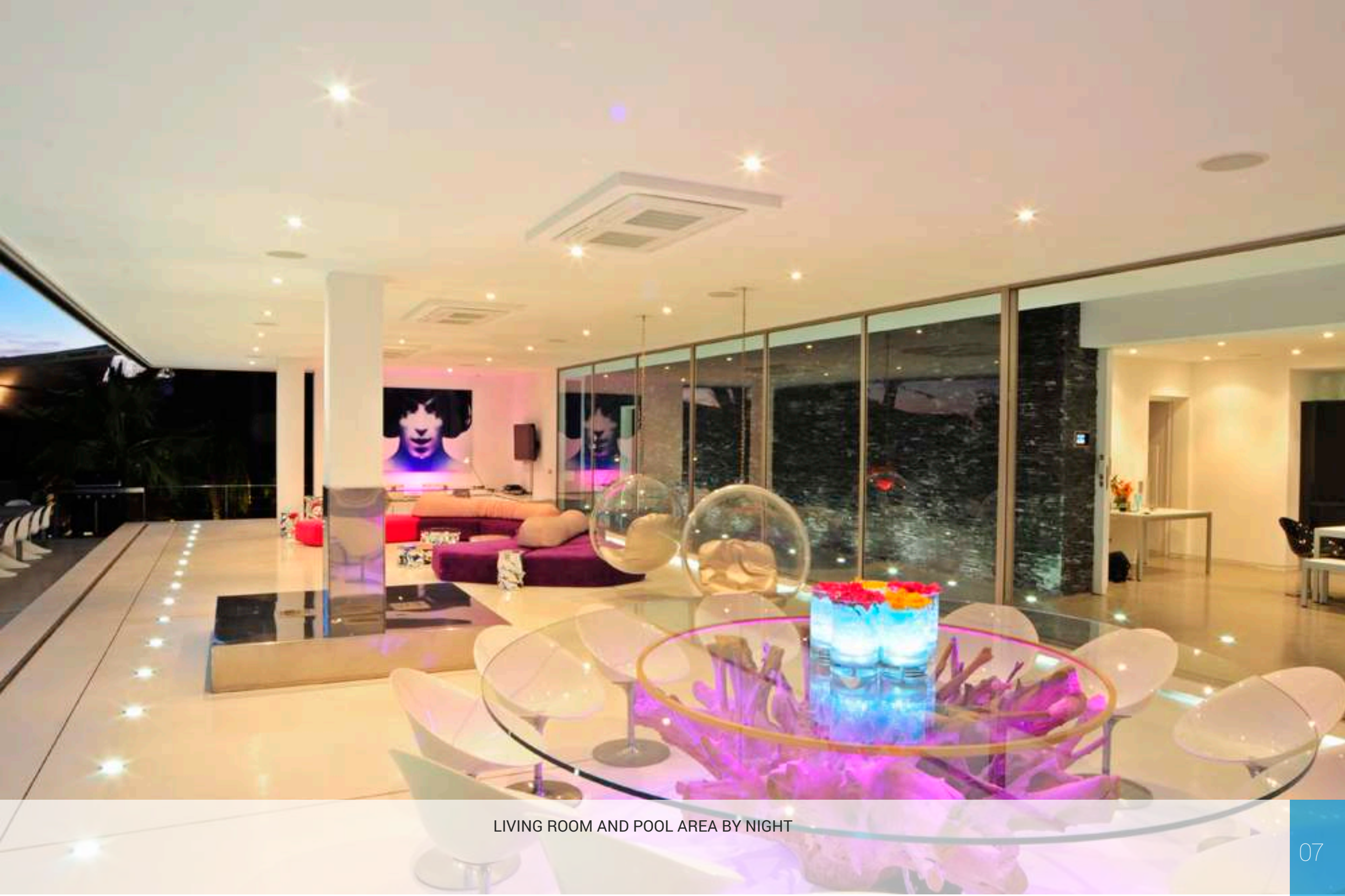
LIVING ROOM AND POOL AREA BY NIGHT