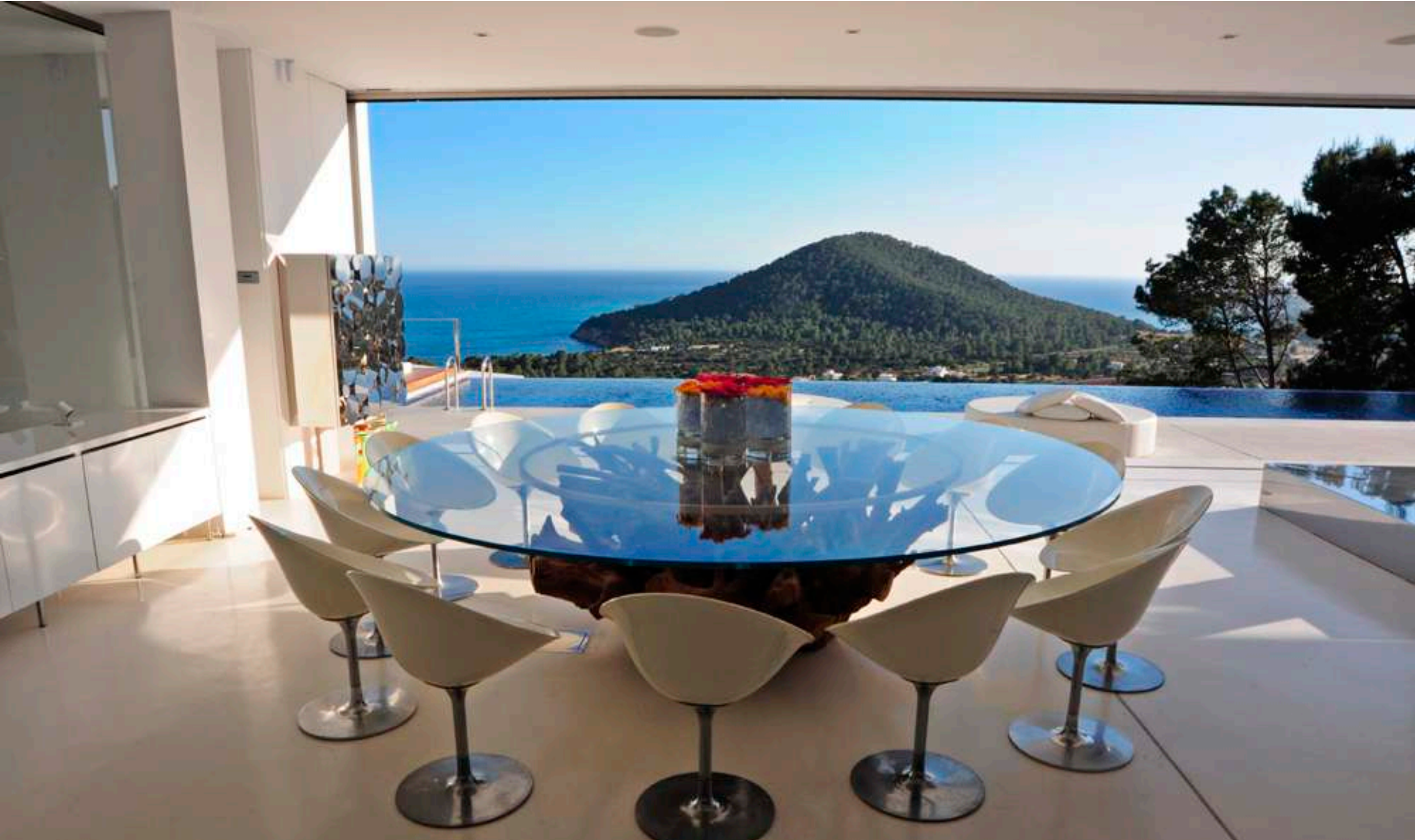
LIVING ROOM WITH A VIEW TOWARDS SA CALETA AND CALA YONDAL